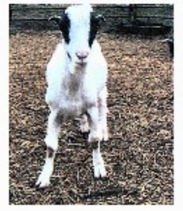
$90 D) 5 month old Buck Lamacha/Saanen ( Mom is Doe E) Crossed with Alpine