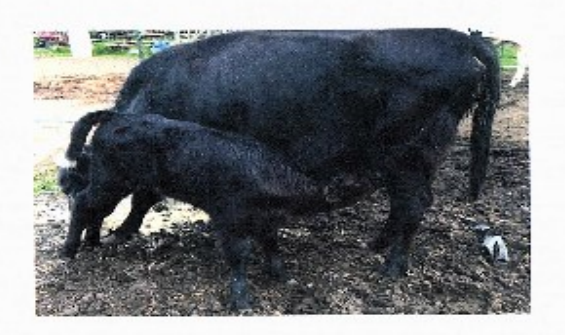
C) born Sept 1,2019 bull calf.