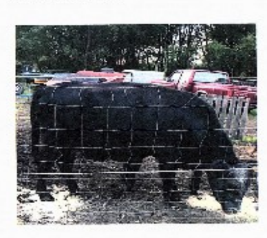
D) 4-5 year old Heiter -$750 comes with hull call. (preed unknow a good guess would be Highlander Angus