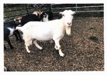
E) 3-4 year old Lamachia/ Saanen Doe $125

Breed one time. Live birth on her own. Gave a baby buck (kid is BUCK D)