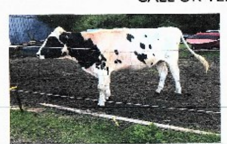
A) 2 year old Bull Hoistien $850