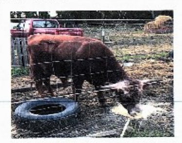
B) 1 1/2 year old bull (Smaller not sure of his breed) $ 600.00